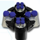
Tissue Culture Pkg.