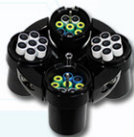
Blood Tube Pkg.