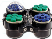
Tissue Culture Pkg.