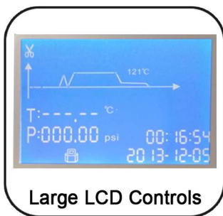
Large LCD Controls