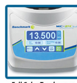
Full Color Touchscreen