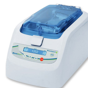
BeadBug™ 6 Six Position Homogenizer

Light Source: 8W UV-C Bulb Int. Dimensions: 19.7 x 15.4 x 15.7 in.