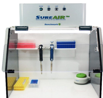
SureAir™ PCR Workstation