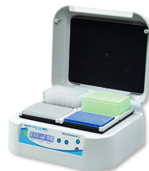
Incu-mixer™ MP Heated Microplate Vortexer, 4 position Mixer

Speed Range: 200 to 13,500 rpm (up to 16,800xg) Capacity: 24 x 1.5/2.0ml 2 x PCR Strips (16 x 0.2ml)