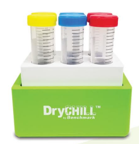
Item: DC0650 6 x 50 ml tubes (29mm)

PO Box 709 Edison, NJ 08817 Ph: 908-769-5555 Fax: 732-313-7007 Web: www.BenchmarkScientific.com Email: Info@BenchmarkScientific.com