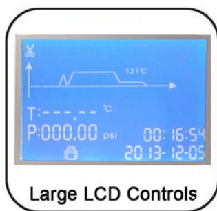
Large LCD Controls