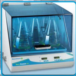
INCUSHAKE ® 10L/LR