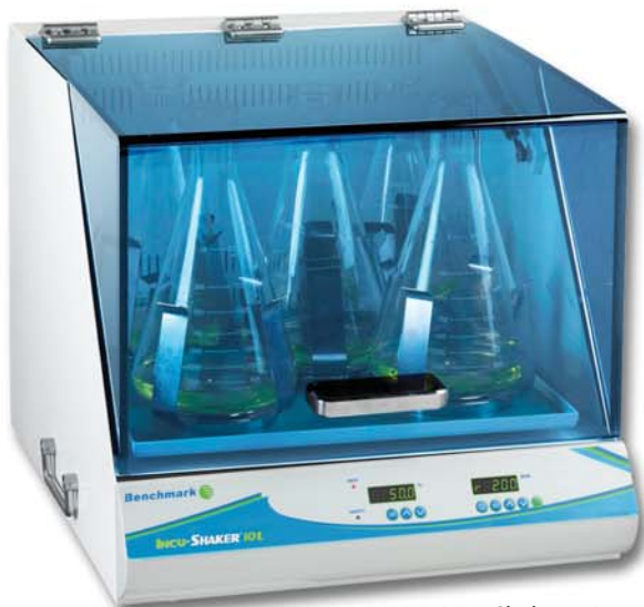
Incu-Shaker 10L (H1010)

The new Incu-Shaker™ series of shaking incubators provide digitally regulated temperature with precisely controlled, circular (orbital) mixing, optimized for the culture of a wide variety of cell types.