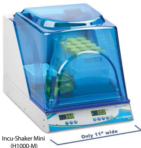
Incu-Shaker Mini (H1000-M)

Temperature, shaking speed and run time are displayed on the large LED control panel located on the front of the unit. The integral microprocessor includes a constant monitoring system that verifies and maintains accuracy through the duration of the program. Sophisticated over-temperature and over-speed controls ensure long life, safety and sample integrity.