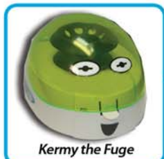
Kermy the Fuge