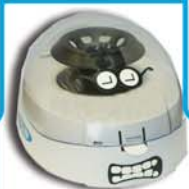
The Angry Professor