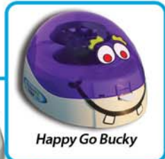
Happy Go Bucky