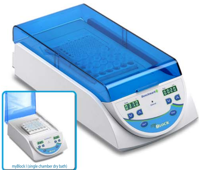
myBlock I (single chamber dry bath)

Benchmark's myBlock series is a "next generation" product line that introduces several major advantages over traditional dry baths. They are the first digital dry baths to include advanced microprocessor controls, timed or continuous operation and a removable hinged lid. In addition, an optional external temperature feedback probe can be positioned directly inside a sample tube, providing real-time control and monitoring of actual sample temperature .